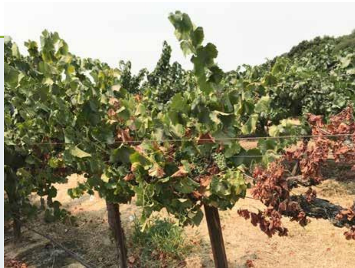
PHOTO 5. Certain combinations of fungal and viral infections can be deadly. These 25-year-old CH04/Freedom vines are gradually declining. Infected vines tested positive only for GLRaV-3 and Phaeomoniella chlamydosporum , one of the fungal pathogens responsible for the Esca/young vine decline complex.

Currently, California nursery certification program and industry propagation practices focus on testing economically important viruses in foundation blocks and nursery increase blocks in order to eliminate their spread. There is no certification requirement to test propagation materials for fungal pathogens. We do not even know what proportion of plant material is already infected with fungal pathogens prior to field planting. Funded by research grants from the American Vineyard Foundation, Dario Cantu's