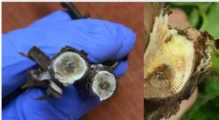
PHOTO 4. One-year-old green bench grafts of CH Wente/101-14, PN 459/101-14, CH 17/101-14 destined for planting in 2018 growing season were found to be infected by Cy lindrocarpon spp and Phaeoacremonium aleophilum .

Currently, California nursery certification program and industry propagation practices focus on testing economically important viruses in foundation blocks and nursery increase blocks in order to eliminate their spread. There is no certification requirement to test propagation materials for fungal pathogens. We do not even know what proportion of plant material is already infected with fungal pathogens prior to field planting. Funded by research grants from the American Vineyard Foundation, Dario Cantu's