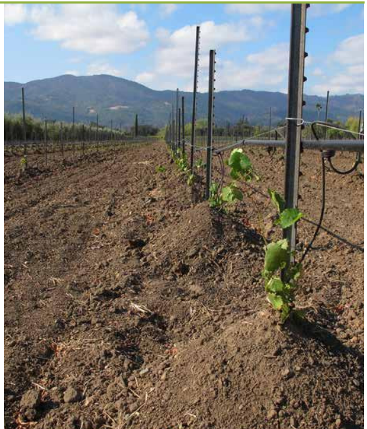
PHOTO 8: Late-planted green potted MB596/VR O39-16 vines mounded before first frost. November 2, 2017. Rutherford, CA