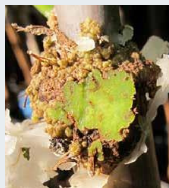
Internal tissue structure of callus shown above