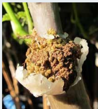
Surface of callus at disbudding site on rootstock shaft of CS412.1/O39-16.1 green vine (20 weeks old)