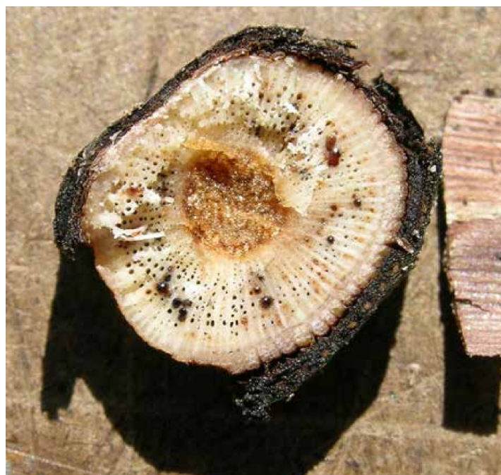
PHOTO 2: Section through trunk of 1-year old potted dormant PN 777/RG vine

Fungal pathogens most commonly associated with grapevine nursery stock include Phaeoacremonium , Phaeomoniella and Cylindrocarpon species. These pathogens are fairly ubiquitous, and it is unusual to find planting stock that is free from them. Such pathogens are known to interfere with wound healing during the propagation process, and this fact renders physical examination of one-year-old dormant stock a useful tool for selecting plants that have lower pathogen loads.