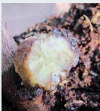
Internal structure of crown gall shown above