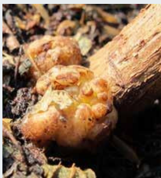
Crown gall at soil surface of CS685.1/VR O39-16.1 green vine (20 weeks old)